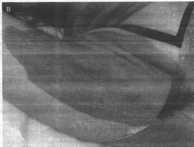
Figure 2. Patient 3 before and 2 weeks after injection of 50 U of botulinum toxin with hyaluronic acid into the right axilla.

hyaluronic acid being added rather than 4% as in the initial injection. This produced virtual anhidrosis of 10 mg per 5 minutes in this axilla. The right side previously injected with botulinum toxin became anhidrotic totally after injection with a further 25 U of botulinum toxin with added hyaluronic acid.