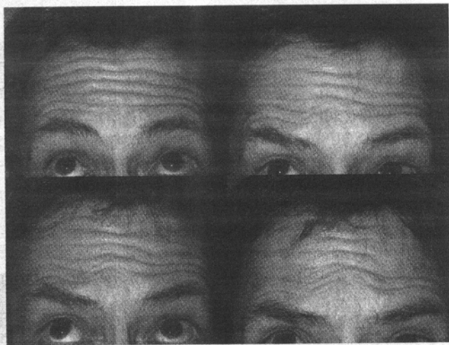
Figure 1. Patient 1 showing progressive effects of a single injection of 5 U of botulinum toxin with hyaluronidase on the right side and 5 U of botulinum toxin along on the left side. Photographs are at preinjection, at Day 5, at Day 7, and at Day 14 showing a slightly wider circle of effect on the right side of the forehead.

The following were included in the objective analysis: gravimetric sweat testing at baseline and at 2 weeks and each month thereafter (Figure 1); digital photography, using the Minor's Iodine test at same appointment; assessment of injection discomfort at time of injection and at the 2-week visit; and assessment of any minor or major adverse events.