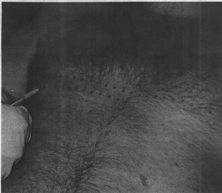
Figure 2. Placement of the initial treatment series.

centration of botulinum toxin at 4 units per 0.1 mL.